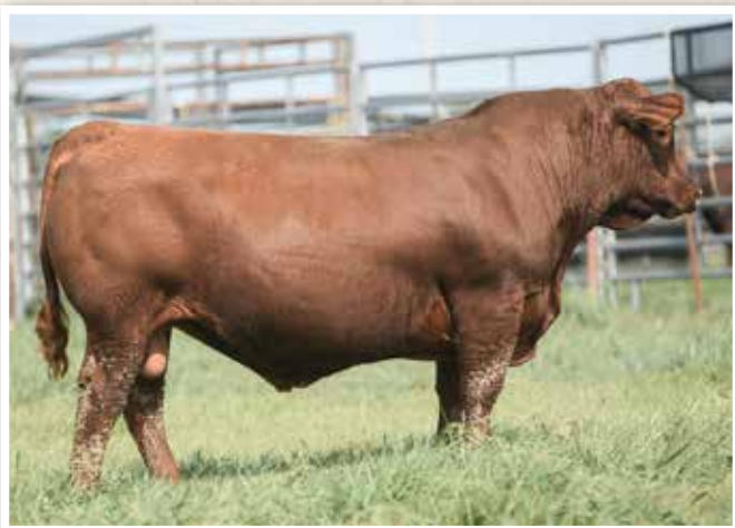
LOT 53 • Jeffries Stockman 55J

118J is a super performance bull with very moderate birth weight, posting a 72 BW and 721 WW (WR 109). His dam posts a 362 day Calving Interval and sells as Lot 164 in this offering.