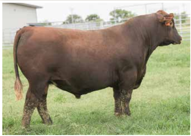
LOT 18 • Jeffries Conquest 95J

332H is a very complete bull with a top 1% YW & ADG and top 2% WW. The combination of Oly 903 X Bieber Rollin Deep in the Jeffries Red Angus program have been unmatched for muscle composition and thickness. His dam sells as Lot 150.