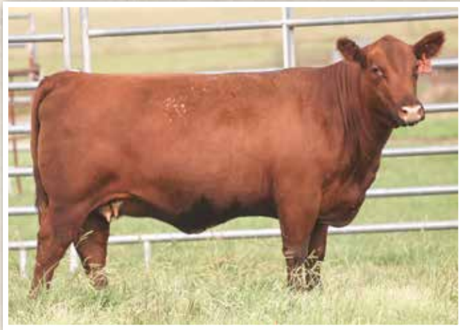
LOT 108 • Jeffries Ms Kanna F75