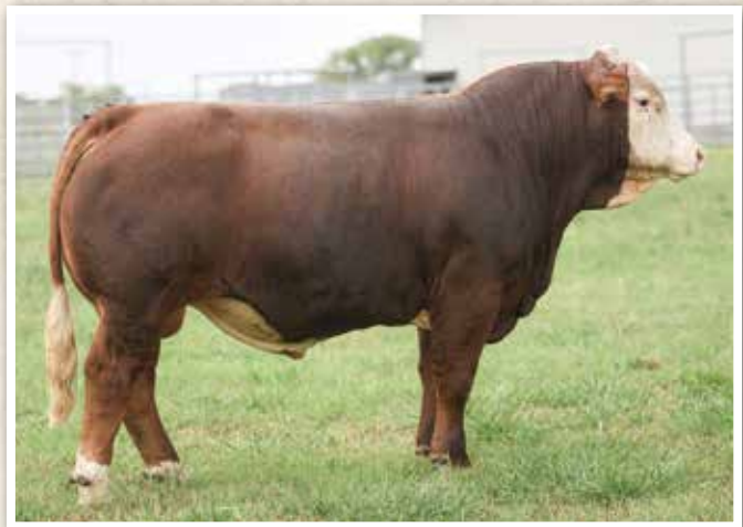
LOT 35 • MLCR Massey's J265

Lot 35 is a thick made, wide butted full blood Simmental bull. If you are after heterosis, no other mating in the world will match the Red Angus cow with Simmental genetics for style, performance and maternal traits.