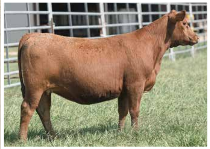
LOT 305 • Jeffries Larkaba J24