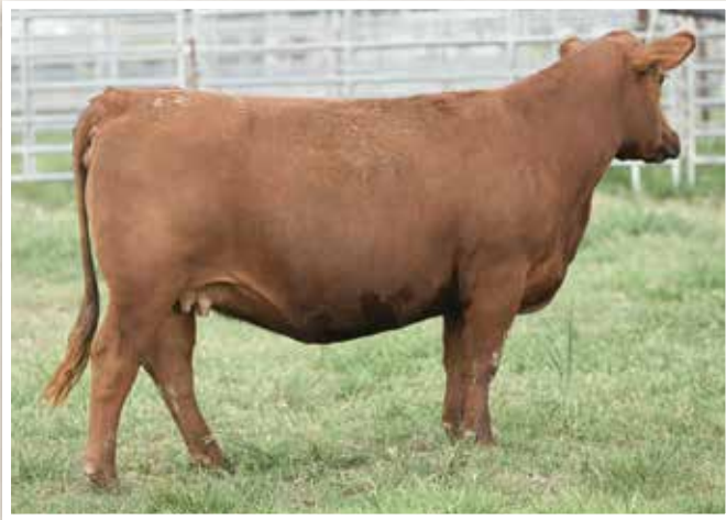
LOT 285 • Jeffries Ms Gloria H301