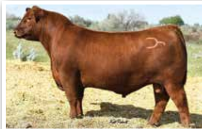
EGL Guidance 9117

Smoky Y Renown 8128F (RAAA:4050574) PIE Stockman 4051 (RAAA:1724236) PIE Quarterback 789 (RAAA:3838837) 9 Mile Big Chief 8281 (RAAA:3968872)