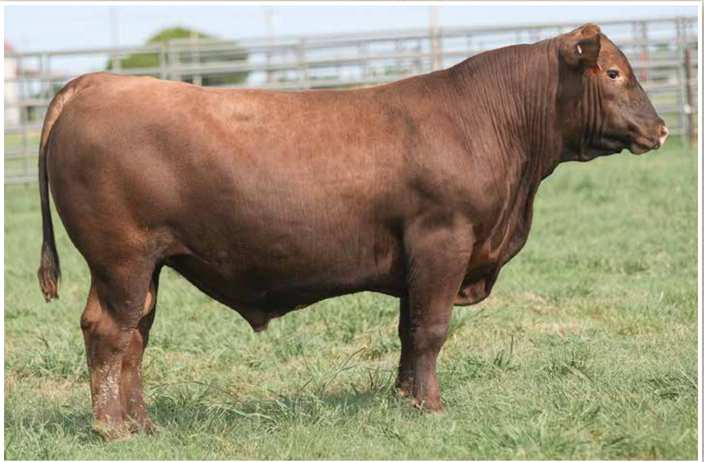
LOT 32 • Jeffries Deep Limit 75J