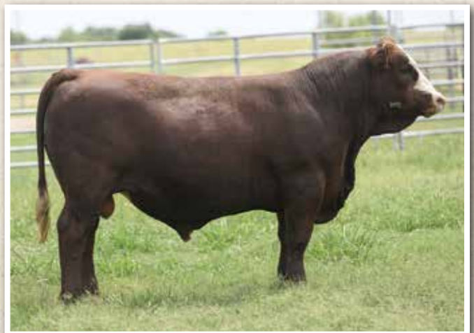
LOT 28 • MLCRA J271

Lot 28 is a half blood Red Angus X Simmental bull with a great deal of style and super performance posting an 800 lb. weaning weight. Put some hybrid vigor to work in your program with this fantastic Silverado X Allegiance herd bull prospect.