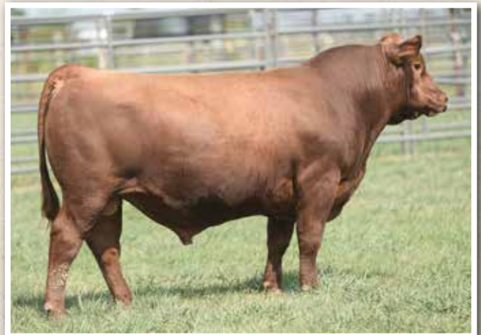
LOT 33 • Jeffries Chief Exec 101J

A Franchise X Rollin Deep pedigree that will be seen throughout this Jeffries Dispersal offering. As you would expect, this super bull posts a 70 lb. BW with a 631 WW. The Rollin Deep daughters are consistently top producers in this herd as shown by Lot 33.