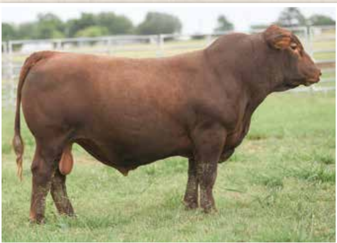
LOT 2 • Jeffries Gladiator 3J

Lot 1 is a powerful paternal grandson of Red U-2 Renown and comes in an extremely attractive package, loaded with growth and EPDs ranking him in the top 1% for WW & YW, top 2% for ADG and top 3% for REA! His dam is an impressive 110 MPPA Rolling Deep daughter. Breeder: Cripple Creek Red Angus Ranch