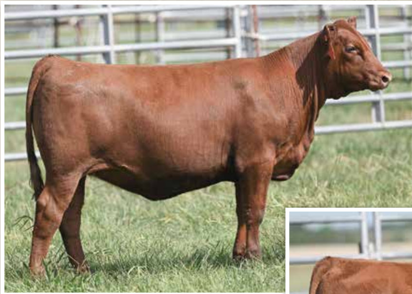
LOT 417 • Jeffries Ms Rambo K86