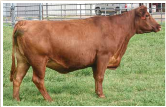
LOT 344 • Jeffries Ms Day E703

PE FROM 1/29/22 TO 5/10/22 TO PIE MILESTONE 9713 (RAAA:4208226). DUE: 12/9/22