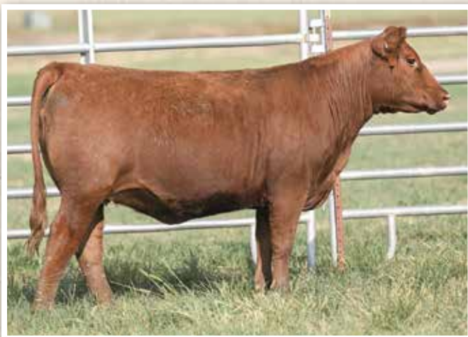
LOT 288 • Jeffries Ms Christine H321

A paternal sister to Lot 286 with even more performance! She posts a 871 lb. WW to ratio 134 and like her sister ranks in the top percentages for growth and carcass EPDs. They are both carrying calves by EGL Guidance 9117. AI BRED ON 2/14/22 TO EGL GUIDANCE 9117 (RAAA:4208972). PE FROM 3/5/22 TO 5/10/22 TO EGL GUIDANCE 9117 (RAAA:4208972). DUE: 1/14/23