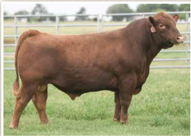
LOT 47 • Jeffries Wideload 29J

A very thick and moderate framed son of HXC Conquest 4405P. Conquest is the high accuracy bull that ranks 5% for BW, 10% for CEM, and 13% for CED & DMI.