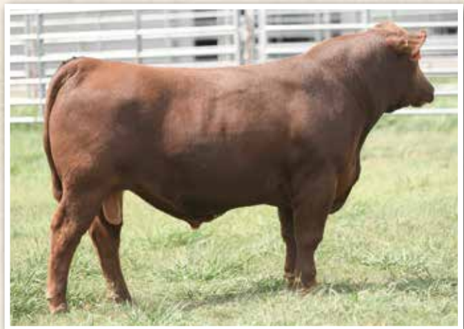
LOT 9 • Jeffries Aro 128J

A Flying K Max grandson offering top replacement heifer opportunities posting a top 2% MILK and top 9% STAY EPD. His dam is one of the top performance queens of the Jeffries Complete Dispersal Auction with an astounding 113 MPPA – she sells as Lot 359!