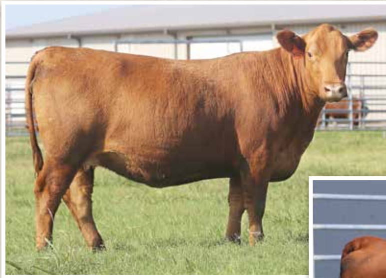
LOT 247 • Jeffries Bonnell H113