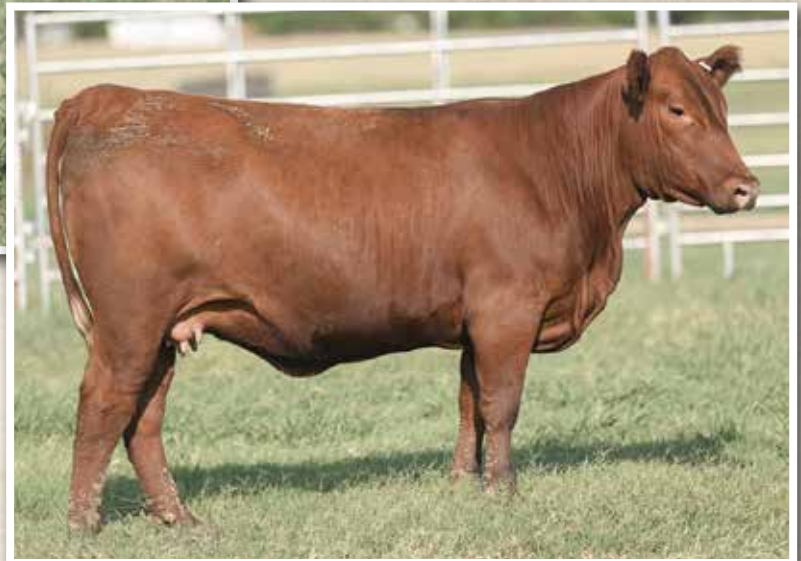
LOT 319 • Jeffries Ms Gold J104