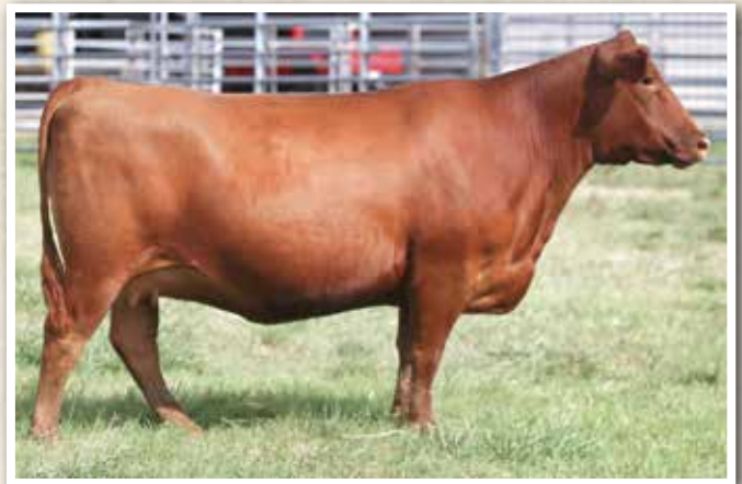
LOT 152 • Jeffries Ms Lady G26

PE FROM 2/28/22 TO 5/10/22 TO SMOKY Y RENOWN 8128F (RAAA:4050574).