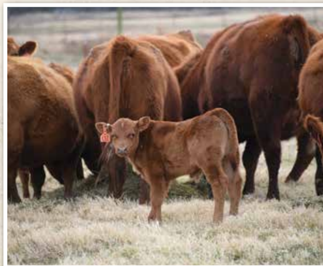
LOT 394: OUT OF SALE

This Fritz Justice X Messmer Jericho daughter focuses on calving ease and maternal traits as indicated by her top 11% HB, 9% CED, 10% BW, top 15% ME, 17% CEM, 19% STAY and 15% MARB. PE FROM 3/2/22 TO 5/10/22 TO 4MC SAGA530 7304 (RAAA:3993146). DUE: 12/9/22