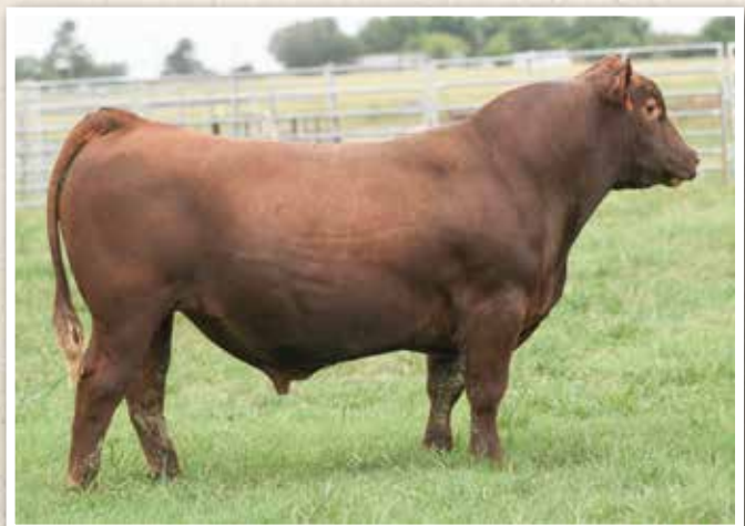
LOT 16 • Jeffries Wideload 36J

If you have heifers to breed, this 65 lb. birth weight, 15 CED, -4.6 BW Pelton Wide Load son would be an excellent prospect. His dam brings two highly maternal bulls to the pedigree in 9 Mile Franchise and Fine Line Mulberry.