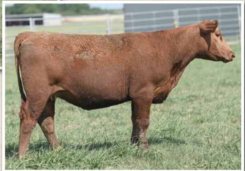
LOT 325 • Jeffries Ms Day J203