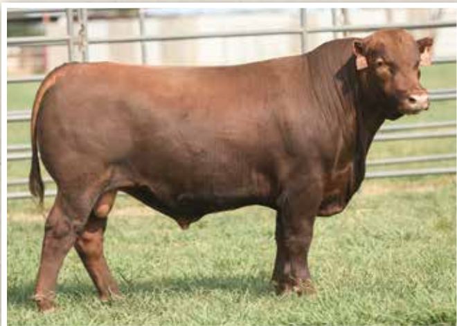
LOT 31 • Jeffries Empire 170J

Lot 30 is a larger framed bull with 7 traits in the top 20% of the breed but still offers a moderate 74 lb. birth weight. His dam posts one of the highest IMF measurements of the herd with a 7.88 IMF to ratio 152!