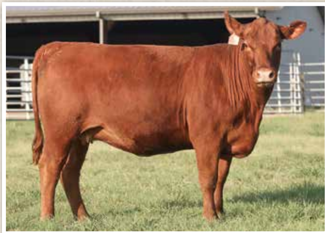
LOT 205 • Jeffries Ms Duchess G282