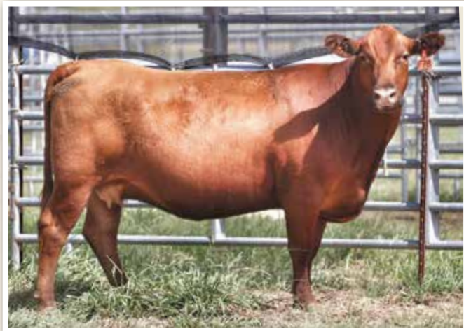
LOT 148 • Jeffries Ms Lakota F78

F67 is a solid production cow with a 103 MPPA and a 105 AWR. Her Gladiator X Timeless pedigree offers tremendous calving ease and carcass traits with a 6% CED & 5% BW and 6% GM & MARB. Her dam sells as Lot 38 and a daughter sells as Lot 434. PE FROM 2/28/22 TO 5/10/22 TO 9 MILE BIG CHIEF 8281 (RAAA:3968872). DUE: 12/9/22