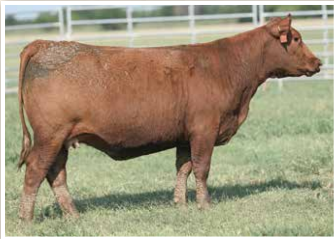
LOT 295 • Jeffries Lass H342

AI BRED ON 1/25/22 TO EGL GUIDANCE 9117 (RAAA:4208972). DUE: 11/3/22 PE FROM 1/29/22 TO 5/10/22 TO JEFFRIES STOCKMAN 94J (RAAA:4466965).