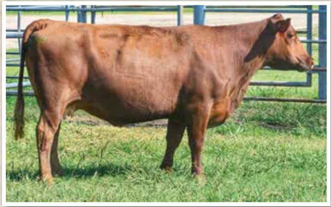
LOT 379 • Jeffries Lass B738