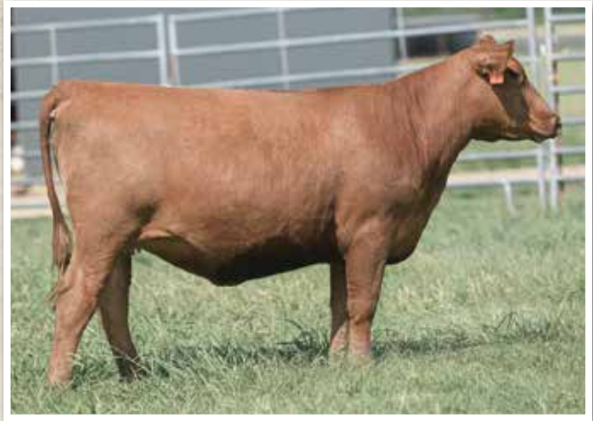
LOT 312 • Jeffries Ms Jena J76

AI BRED ON 1/15/22 TO EGL GUIDANCE 9117 (RAAA:4208972). DUE: 10/24/22 PE FROM 1/29/22 TO 5/10/22 TO BIEBER FOREFRONT H551 (RAAA:4308161).