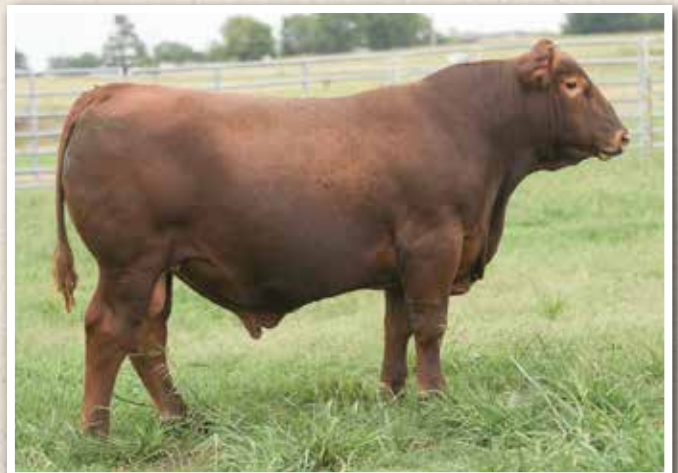
LOT 5 • Jeffries Stockman 147J

Lot 5 is certainly a top prospect coming from a Franchise daughter touting a 113 MPPA! Here is a bull that offers superior growth (top 5% or better for WW, YW, ADG & CW) and ranks in the top 1% of the entire breed for MILK. 74 BW to 796 WW and a 127 WR!