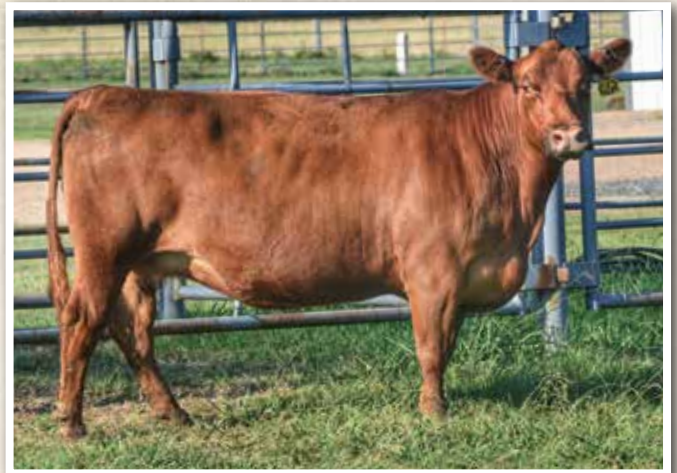
LOT 372 • Jeffries Ms Chateau C12

PE FROM 3/2/22 TO 5/10/22 TO 4MC SAGA530 7304 (RAAA:3993146). DUE: 12/9/22