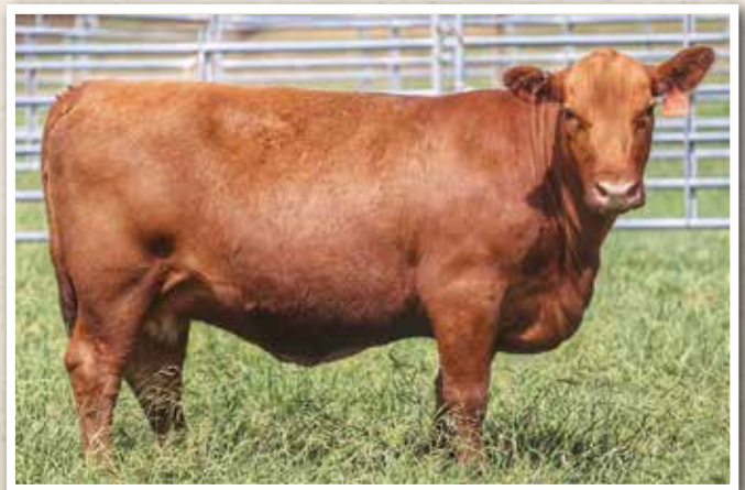
LOT 169 • Jeffries Flower G78

This female's sire – Jeffries Checotah 817C – is one of the most famous animals to come out of the Jeffries program. Checotah daughters will be highly sought with their style and productivity and this one is safe to Smoky Y Renown 8128F. G78 has an amazing 325 day Calving Interval. AI BRED ON 1/27/22 TO PIE QUARTERBACK 789 (RAAA:3838837). PE FROM 2/28/22 TO 5/10/22 TO SMOKY Y RENOWN 8128F (RAAA:4050574). DUE: 12/9/22