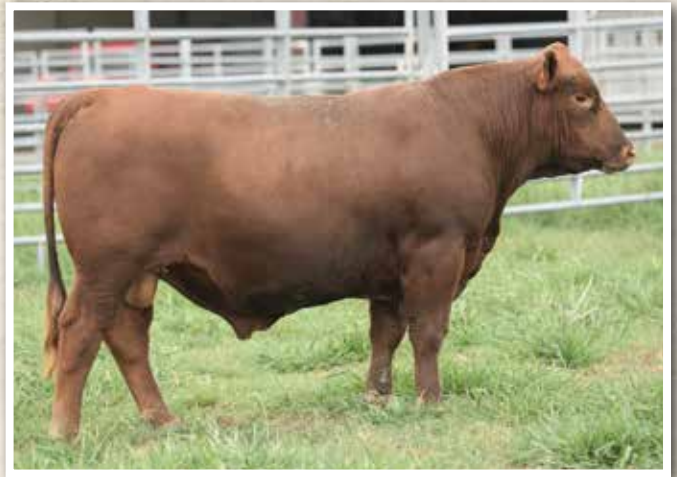
LOT 20 • Jeffries High Capacity 13J

A rare UBAR High Capacity son offering balance, growth and style. If you want a larger framed bull to increase future calf weights, take a look at this tremendous prospect. His dam's pedigree combines Conquest X Rolling Deep.