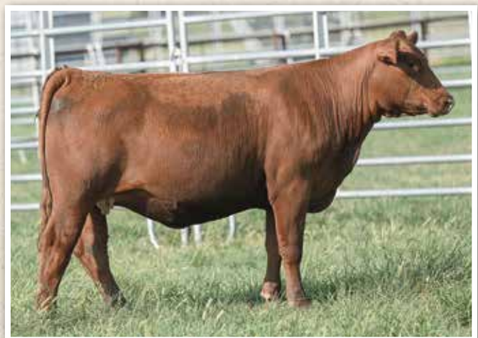
LOT 299 • Jeffries Ms Karina J192

AI BRED ON 1/25/22 TO EGL GUIDANCE 9117 (RAAA:4208972). DUE: 11/3/22 PE FROM 1/29/22 TO 5/10/22 TO JEFFRIES OLY 322H (RAAA:4467233).