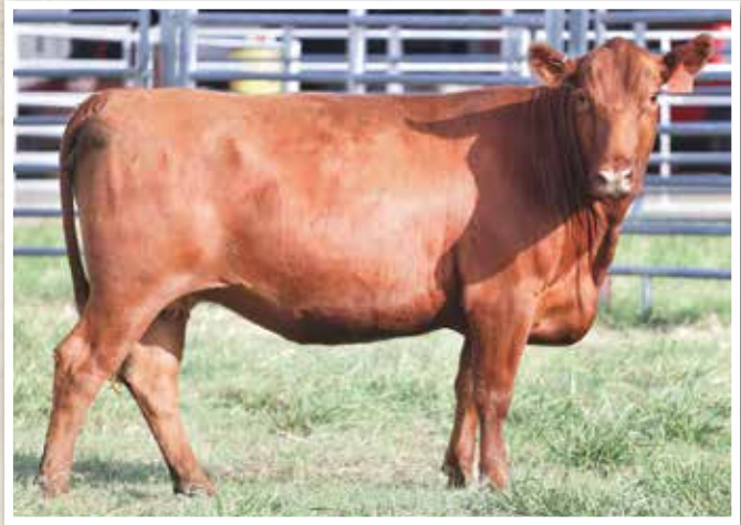
LOT 174 • Jeffries Ms Sam G104

AI BRED ON 2/22/22 TO PIE STOCKMAN 4051 (RAAA:1724236). DUE: 12/1/22 PE FROM 2/28/22 TO 5/10/22 TO SMOKY RENOWN 8128F (RAAA:4050574).