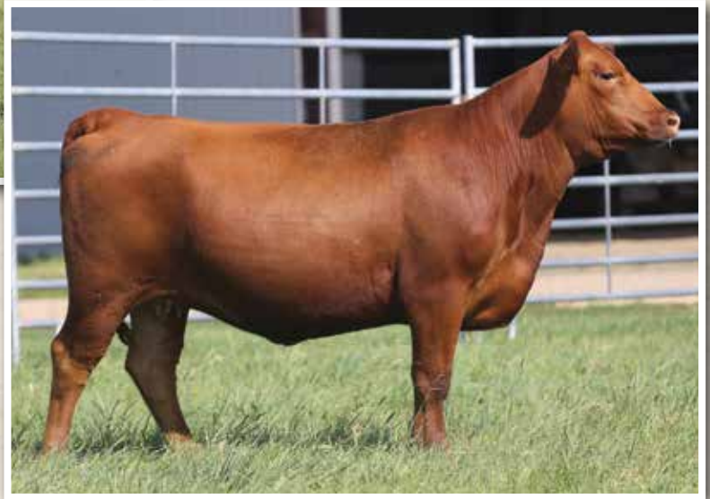
LOT 246 • Jeffries Ms Abigrace H108