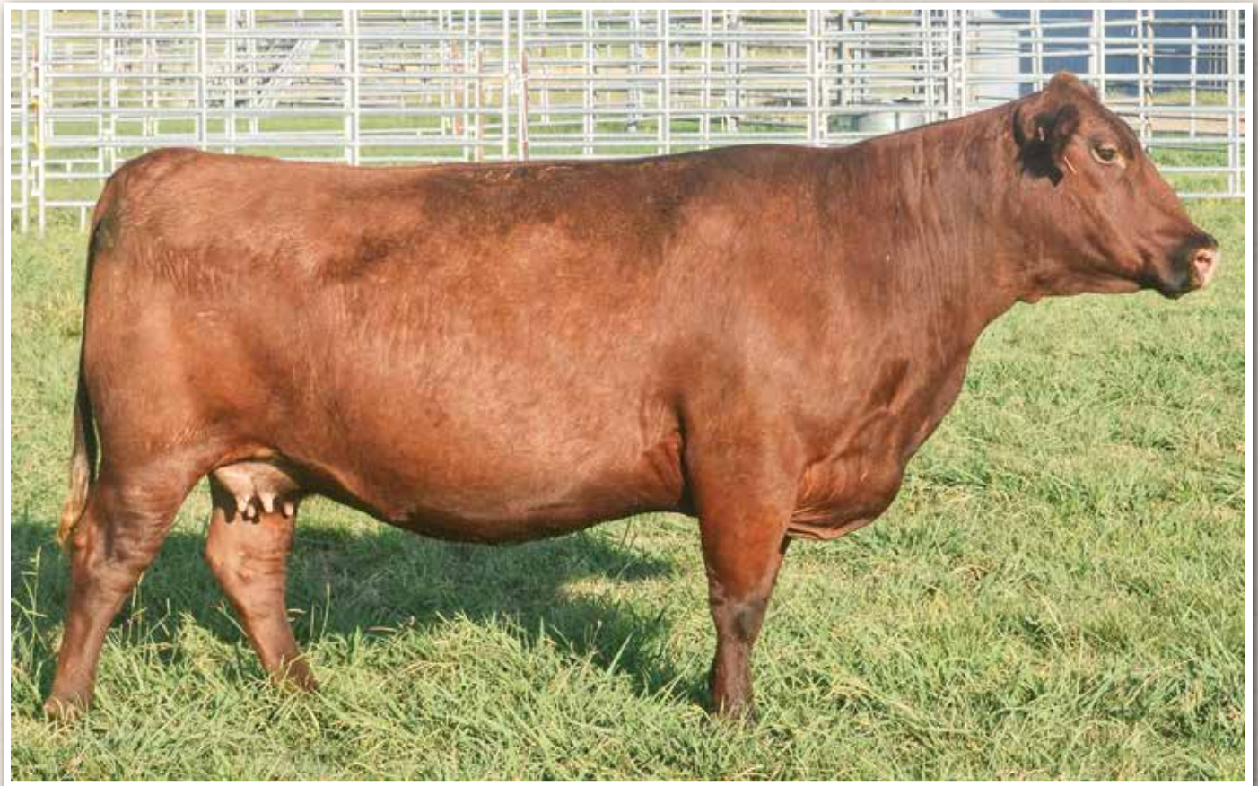
LOT 350 • Jeffries Dakel D289

The 22 head of "D Model" 2016 born six-year-old cows are starting to show you the "heart-of-the-herd" and what put the Jeffries Red Angus program on the map. These solid, high production cows will wean some of the heaviest calves in the weaning pen bar none. Get ready for daughters of Rollin Deep, New Direction, Smart Choice, Thunder, Alliance and more!