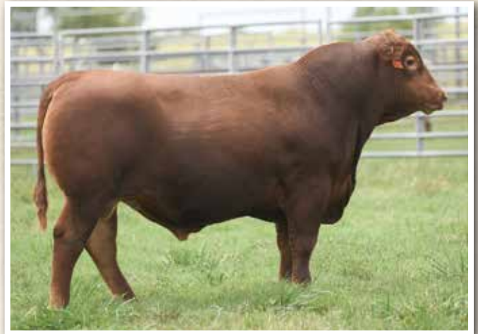
LOT 27 • Jeffries Empire 148J

The bulls offered in the Jeffries Dispersal Auction are consistently moderate birth with tremendous growth as exemplified by 148J with his 70 lb. birth weight and 623 lb. weaning weight.