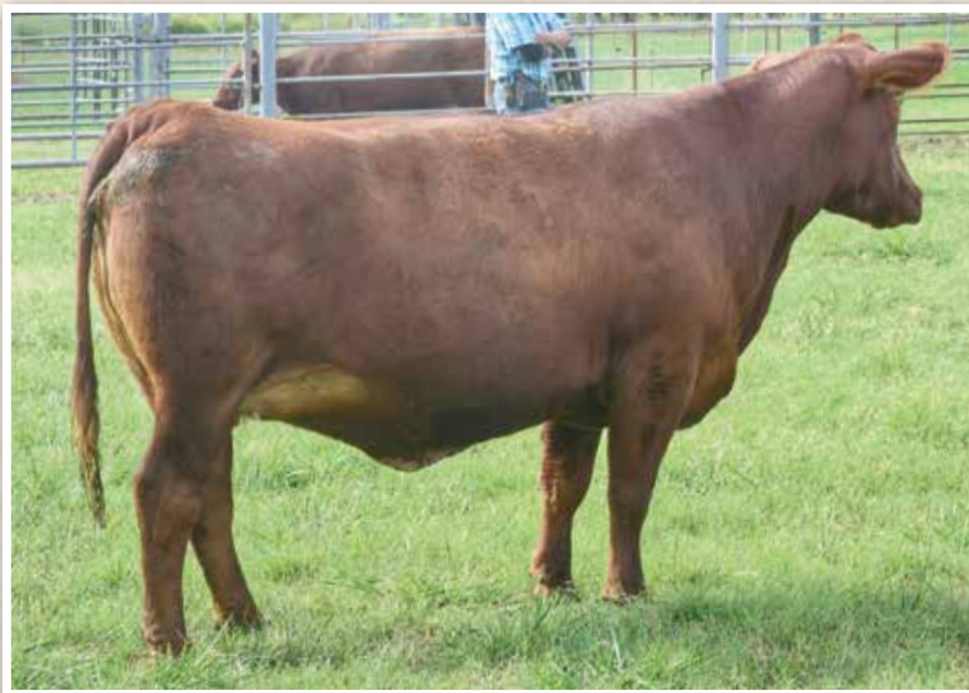
LOT 138 Jeffries Rose F965

F963 can be summed up as a high growth, high carcass female with a top 15% WW, 18% YW and 11% CW & 17% REA. A daughter sells as Lot 326. AI BRED ON 1/18/22 TO PIE MILESTONE 9713 (RAAA:4208226). PE FROM 1/29/22 TO 5/10/22 TO PIE MILESTONE 9713 (RAAA:4208226). DUE: 2/12/23