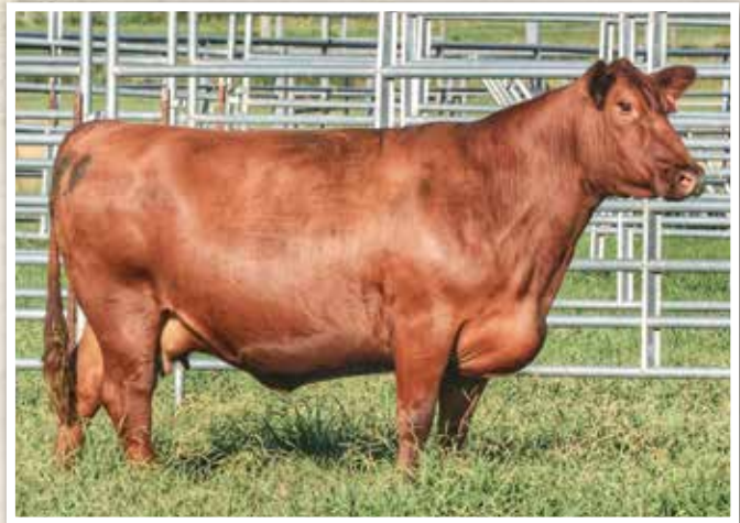
LOT 351 • Jeffries Ms Pride D174

AI BRED ON 2/25/22 TO PIE MILESTONE 9713 (RAAA:4208226). DUE: 12/4/22 PE FROM 3/2/22 TO 5/10/22 TO 4MC SAGA530 7304 (RAAA:3993146).