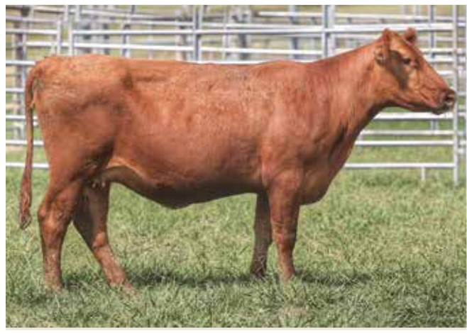
LOT 186 • Jeffries Ms Day G166