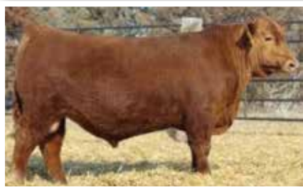
PIE Quarterback 789

4MC Saga530 7304 (RAAA:3993146) 4MC One Of A Kind 818 (RAAA:3994432) PIE Milestone 9713 (RAAA:4208226) PIE Stockman 9173 (RAAA:4210230)