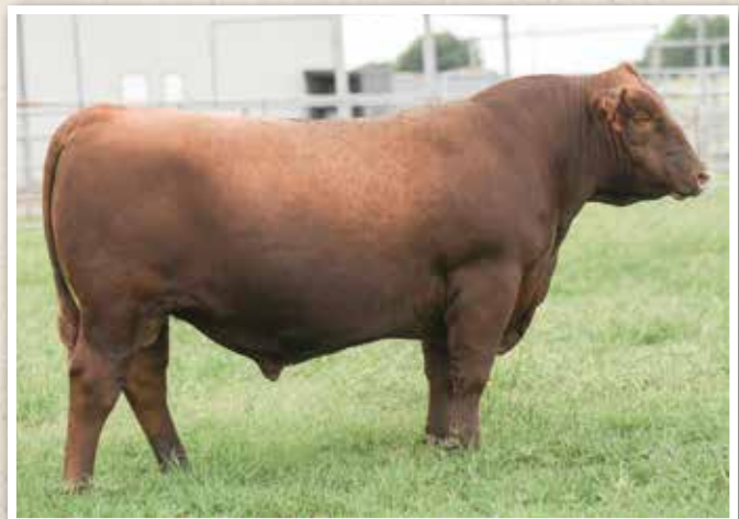
LOT 10 • Jeffries Chief Exec 119J

If performance and selling calves by the pound is a focus of your beef program, take a look at this 810 lb. weaning weight powerhouse with only a 68 lb. birth weight. His dam is a super Bieber Spartacus daughter and sells as Lot 172.