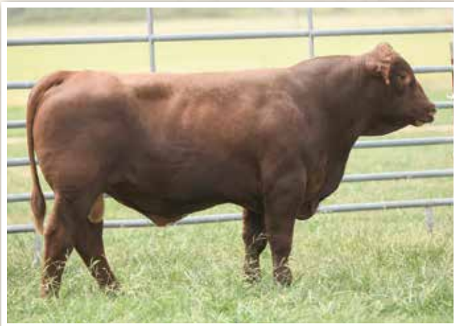
LOT 30 • Jeffries Stockman 121J

29 bulls deep into the offering and here comes a 75 lb. BW, 659 lb. WW Empire son from a cow touting a 111 IMF ratio. The consistency of the bulls is amazing and if your program needs multiple bulls that will sire uniform traits, mark Sept. 30 on your calendar.