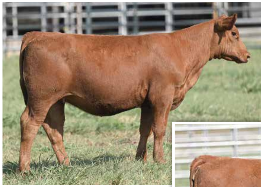
LOT 443 • Jeffries Ms Goldie K101