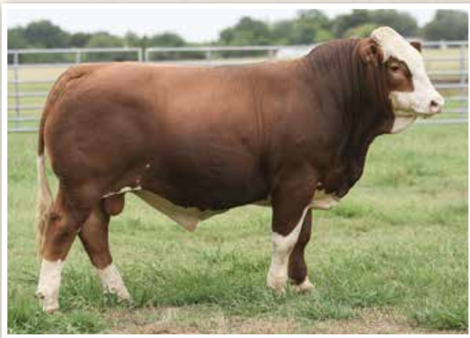
LOT 24 • MLCR Masseys J267

Lot 23 comes from one of the highest generating cow families in the Red Angus breed estimated at $3+ million dollars. His sire – Smoky Y Renown -- is a heavy muscled, thick-made bull that obviously mated well with the Abigrace cow family.