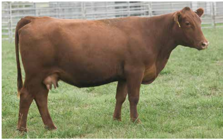
LOT 231 Jeffries Priscilla H39

AI BRED ON 1/13/22 TO PIE MILESTONE 9713 (RAAA:4208226). PE FROM 1/29/22 TO 5/10/22 TO PIE MILESTONE 9713 (RAAA:4208226). DUE: 12/9/22