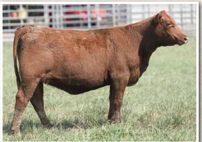
LOT 323 • Jeffries Ms Rosette J165

If you desire maternal substance in your cowherd be sure and take a look at this Aro X Thunder bred heifer with a top 7% MILK EPD. One of the basics for heavy weaning calves is milk production in their mamas and Lot 323 certainly delivers in this regard. AI BRED ON 1/25/22 TO EGL GUIDANCE 9117 (RAAA:4208972). PE FROM 1/29/22 TO 5/10/22 TO JEFFRIES STOCKMAN 94J (RAAA:4466965). DUE: 1/14/23