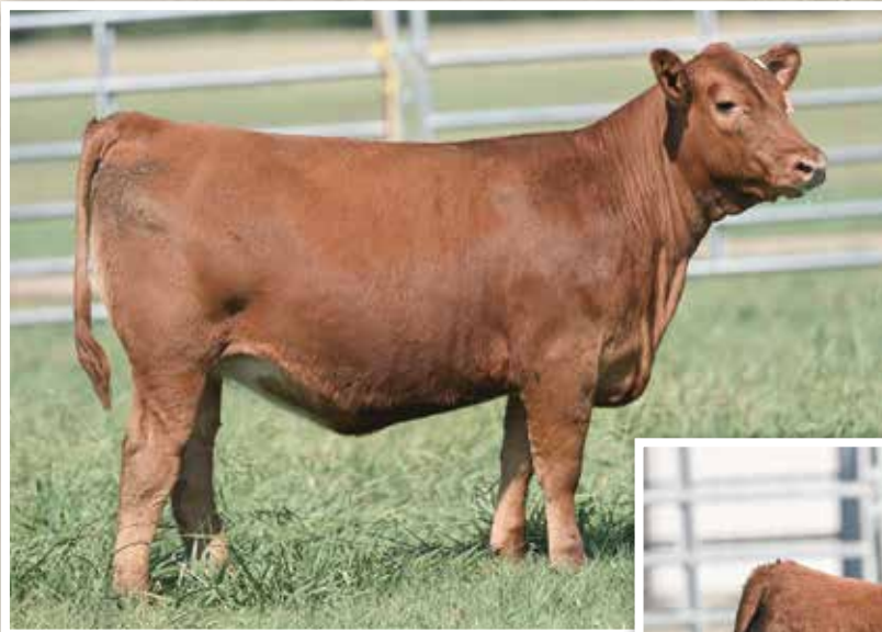
LOT 449 • Jeffries Ms Fire Fly K121