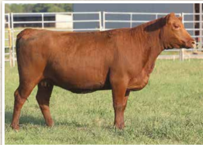
LOT 258 • Jeffries Ms Jane H165

AI BRED ON 3/2/22 TO EGL GUIDANCE 9117 (RAAA:4208972). DUE: 12/9/22 PE FROM 3/5/22 TO 5/10/22 TO EGL GUIDANCE 9117 (RAAA:4208972).