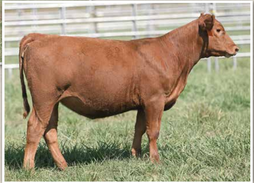
LOT 445 • Jeffries Ms Right K106