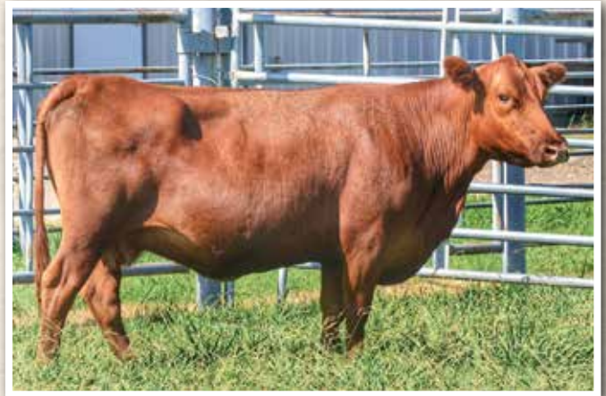
LOT 371 • Jeffries Ms Jena C77

PE FROM 3/2/22 TO 5/10/22 TO 4MC SAGA530 7304 (RAAA:3993146). DUE: 12/9/22