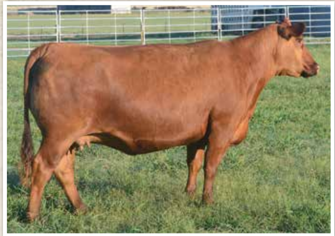
LOT 112 • Jeffries Primrose F810

PE FROM 1/29/22 TO 5/10/22 TO PIE MILESTONE 9713 (RAAA:4208226). DUE: 12/9/22