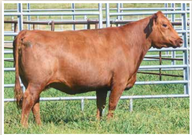
LOT 352 • Jeffries Priscilla D303

AI BRED ON 2/26/22 TO PIE MILESTONE 9713 (RAAA:4208226). PE FROM 3/2/22 TO 5/10/22 TO 4MC SAGA530 7304 (RAAA:3993146). DUE: 1/13/23