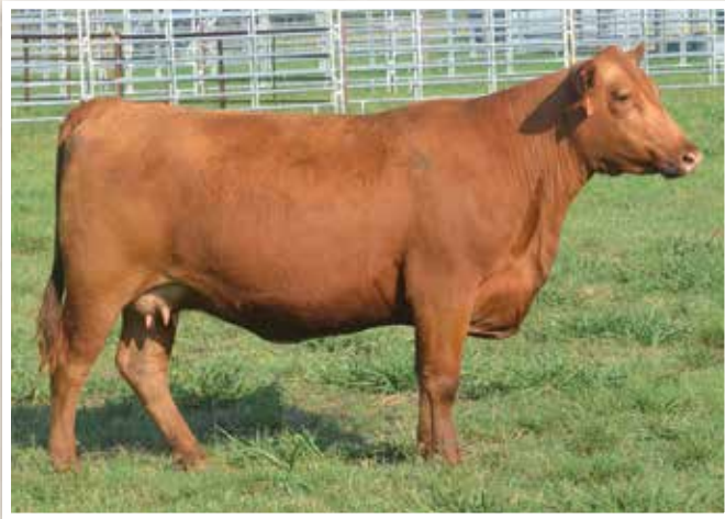
LOT 264 • Jeffries Ms Diamond H187