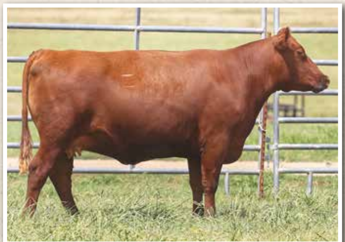
LOT 153 • Jeffries Firefly G191

PE FROM 2/28/22 TO 5/10/22 TO SMOKY Y RENOWN 8128F (RAAA:4050574).