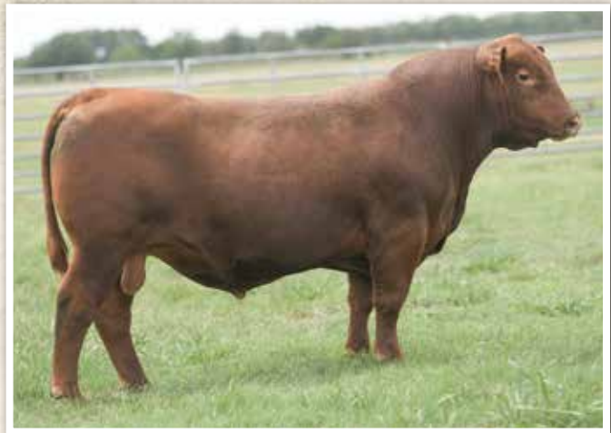
LOT 8 • Jeffries Empire 193J

A paternal brother to Lot 7 offering a 69 lb. (-3.3 EPD) birth weight and a 18 CED to rank in the top 4% of the breed. His dam is a top producing "B" model with an MPPA of 110. Don't miss her selling as Lot 385 in this outstanding Complete Dispersal Sale.