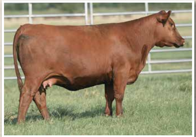
LOT 321 • Jeffries Ms Barbara J115

This Empire X Trailboss heifer is highlighted by her 28% HB, 26% ME, 16% STAY, 9% YG. Her dam sells as Lot 376. AI BRED ON 1/25/22 TO EGL GUIDANCE 9117 (RAAA:4208972). PE FROM 1/29/22 TO 5/10/22 TO JEFFRIES OLY 322H (RAAA:4467233). DUE: 1/14/23