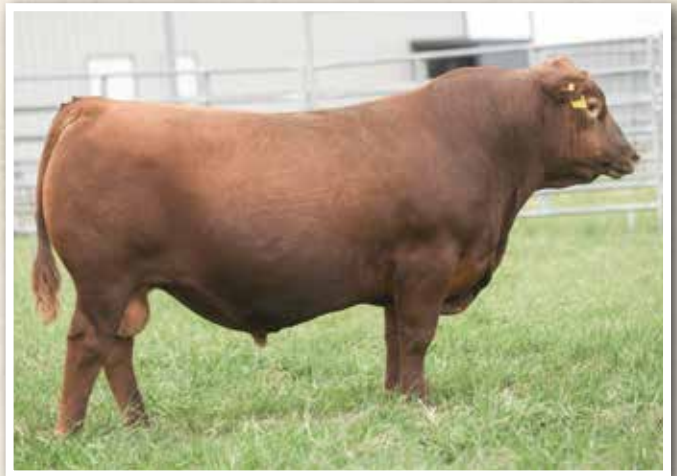
LOT 21 • MLCRA Massey's H245

If you are on the search for a herdsire to create top Red Angus daughters, this is your bull. He offers a top 1% HB and a top 6% ProS and combines Messmer Packer X Bieber Stormer on the maternal side of the pedigree.