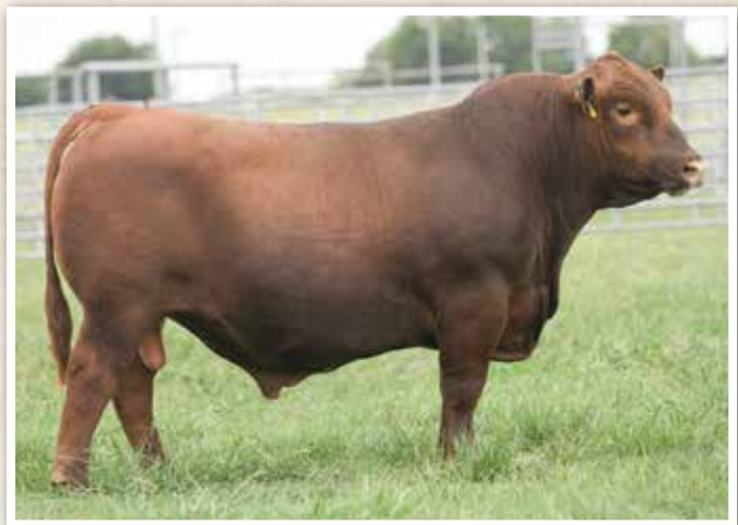
LOT 15 • MLCRA Massey's H257

H257 is a dark red, attractive bull that offers a top 1% HPG EPD and also stacks a 17.8" REA with an IMF of 4.15. If you are looking for a bull with balanced and breed-leading EPDs to build a herd on, be sure and look this stud up on sale day.