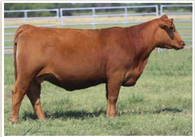
LOT 251 • Jeffries Ms Joten H131

PE FROM 1/29/22 TO 5/10/22 TO PIE MILESTONE 9713 (RAAA:4208226). DUE: 11/7/22