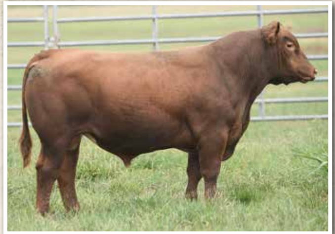
LOT 3 • Jeffries Milestone 42J

In our August sale planning session, 42J was a unanimous pick for top of the sale order combining Gladiator with a 9 Mile Franchise daughter. This is one thick, stout and muscle packed set of bulls! Don't miss out - this is the grand finale to own a Jeffries RA bull.