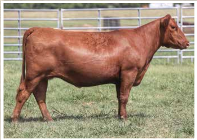
LOT 190 • Jeffries Ms Gold Cup G208

Jerry certainly liked the Gladiator X Wild West combination of genetics and created several of these ¾ sisters to use in the Jeffries program. This super female posts a 6% WW, 4% YW and 4% ADG EPDs. 103 MPPA. PE FROM 2/28/22 TO 5/10/22 TO 9 MILE BIG CHIEF 8281 (RAAA:3968872). DUE: 12/9/22