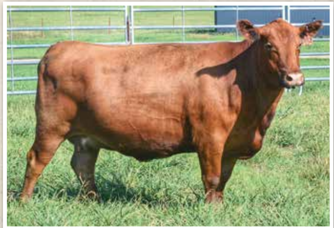
LOT 353 • Jeffries Ms Jan D112

PE FROM 3/2/22 TO 5/10/22 TO 4MC SAGA530 7304 (RAAA:3993146). DUE: 12/9/22