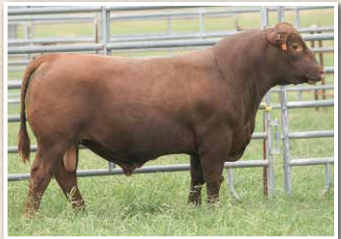
LOT 49 • Jeffries Conquest 38J

This HXC Conquest X Six Mile Utah will get your attention with a 66 lb. birth weight and 672 lb. weaning weight. His dam was one of the top producing females in the Jeffries herd with a 108 MPPA and AWR 109 (6), AYR 109 (4)!