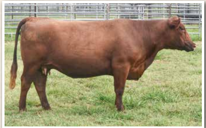
LOT 347 • Jeffries Pride 735

AI BRED ON 1/24/22 TO PIE MILESTONE 9713 (RAAA:4208226). DUE: 11/2/22 PE FROM 1/29/22 TO 5/10/22 TO PIE MILESTONE 9713 (RAAA:4208226).