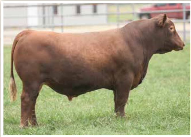
LOT 40 • Jeffries Stockman 106J

Take a look at this high performing Deep Limit X Checotah herd bull prospect that comes at us with a 68 lb. birth weight and a 750 lb. weaning weight (WR 114!). His dam was a first calf heifer with a whopping 106 MPPA on her first calf. She sells as Lot 162.