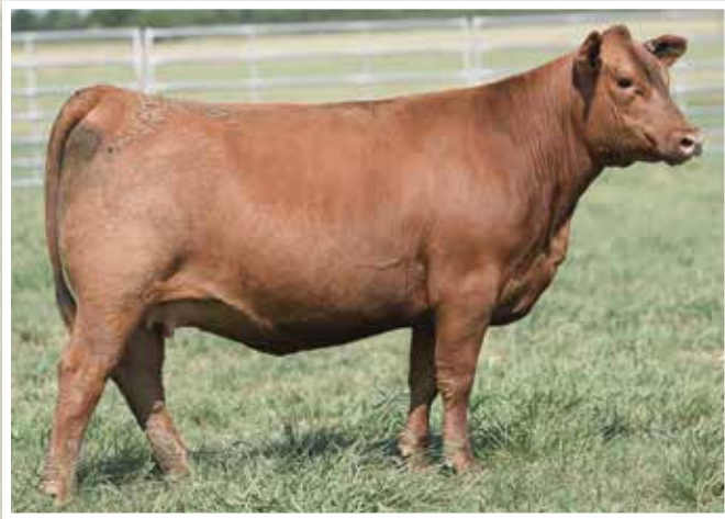
LOT 293 • Jeffries Red Cedar H335