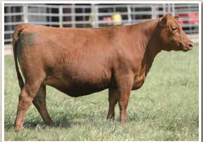
LOT 218 • Jeffries Ms Lakota H343

If you like consistency in your cowherd, don't miss attending the Jeffries Complete Dispersal Auction. Lot 217 & 218 are ¾ sisters with matings of H Hughes X Rollin Deep and represent several "bred alike" females selling in volume September 30th. AI BRED ON 1/24/22 TO EGL GUIDANCE 9117 (RAAA:4208972). PE FROM 1/29/22 TO 5/10/22 TO BIEBER FOREFRONT H551 (RAAA:4308161). DUE: 2/2/23