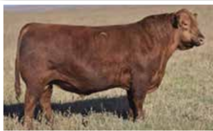
PIE Stockman 4051

4MC Saga530 7304 (RAAA:3993146) 4MC One Of A Kind 818 (RAAA:3994432) PIE Milestone 9713 (RAAA:4208226) PIE Stockman 9173 (RAAA:4210230)