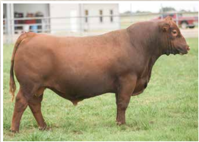
LOT 13 • MLCRA Massey's J263

The Jeffries Complete Dispersal offers some of the highest quality Red Angus genetics in the country. 224J is another of the top herd bull prospects of the day with a high performing 709 WW and 116 WR. His dam was a top cow in the herd posting a 109 MPPA.