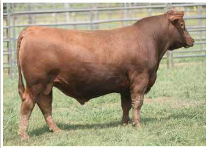
LOT 29 • Jeffries Empire 146J