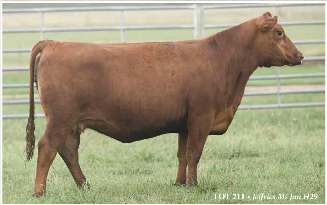
LOT 211 • Jeffries Ms Jan H29

One of the most challenging things to accomplish in the cowherd is getting the first calf heifers to breed back while they are in full lactation and bringing calves to the pen with high weaning weights. These 87 "H Model" females are all confirmed bred back and ready to go for round two. On August 8th, they were the least conditioned set of sale cattle in the Jeffries pastures -- but what would you expect? And what more could you ask for than a first calf heifer to be bred back and ready to roll? Get ready for daughters of "some of the new blood" – Big Chief, 4MC 818, Seneca, Saga, Smoky Y Renown, Andras Thunder, Gladiator, H Hughes, Franchise and more!