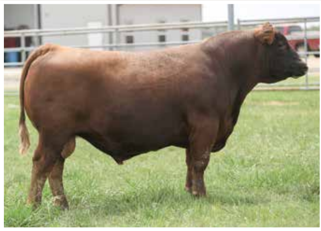
LOT 51 • Jeffries Deep Limit 20J