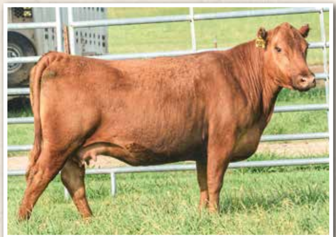
LOT 106 • Jeffries Ms Jo F808