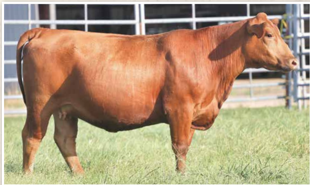
LOT 244 Jeffries Ms Rosette H106

Lot 243 offers more diversity through the maternal side of her pedigree and sire – Gold Bar Tantalize. Her Big Chief sire has proven to be a super stud bull in the Jeffries program and will be well accepted in this Dispersal Auction. Bred to EGL Guidance 9117. AI BRED ON 3/2/22 TO EGL GUIDANCE 9117 (RAAA:4208972). PE FROM 3/5/22 TO 5/10/22 TO EGL GUIDANCE 9117 (RAAA:4208972). DUE: 1/13/23