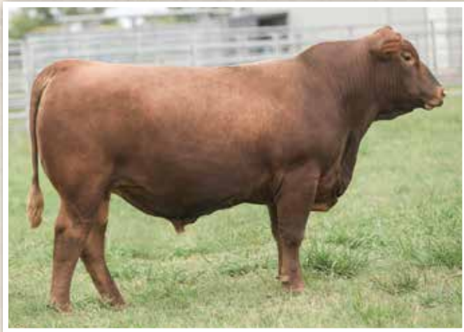
LOT 45 • Jeffries Milestone 107J