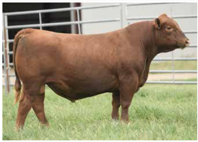
LOT 17 • Jeffries Hughes 332H