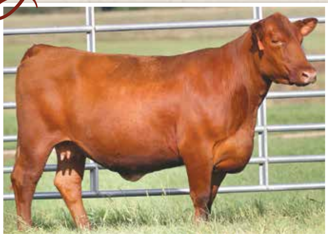
LOT 149 • Jeffries Lakota G7

The 62 head of "G Model", 2019 born three-year-olds represent another great set of young cows in the-prime-of-their-life. Only in a Complete Dispersal Auction do you get the opportunity to come into the herd and pick through every animal the program owns! In this group, get ready for daughters of Gladiator, Rollin Deep, Franchise, Spartacus, VGW Oly, Checotah, Smart Choice and more!