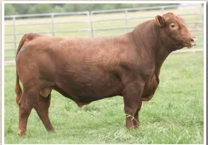
LOT 22 • Jeffries Wideload 62J

Only in a Complete Dispersal Auction do you get the chance to analyze the entire herd and make your buying decisions. This Wideload son's dam sells as Lot 372. 62J offers a moderate 71 lb. birth weight to a 615 weaning weight – profitable performance.