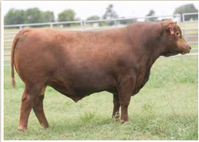
LOT 39 • Jeffries Deep Limit 123J