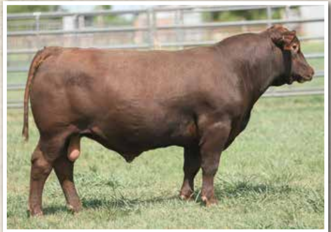
LOT 42 • Jeffries Ard 130J

This high performance Red ARO son weaned at 784 lbs. and will certainly add weight to his future progeny. His dam is a productive cow with a 366 day Calving Interval and is a low BW producer with a 11 CED and -3.0 BW EPD.