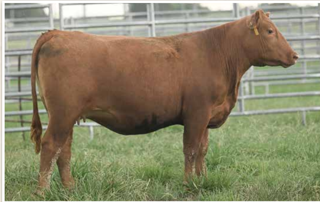
LOT 214 Jeffries Ms Primrose H54

One of the selected feature 2020 heifers posting a top 7% WW, 4% YW and 3% ADG. Greatness runs in the family – her dam was selected as the lead feature female for the 2017 “E” model females. Don’t miss this once-in-a-lifetime Red Angus event – it could change your life. AI BRED ON 1/18/22 TO PIE MILESTONE 9713 (RAAA:4208226). DUE: 11/27/22 PE FROM 1/29/22 TO 5/10/22 TO PIE MILESTONE 9713 (RAAA:4208226).