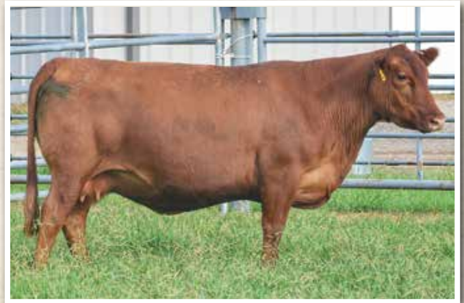
LOT 346 • KMW Abby E732

PE FROM 3/2/22 TO 5/10/22 TO PIE STOCKMAN 9173 (RAAA:4210230). DUE: 1/13/23