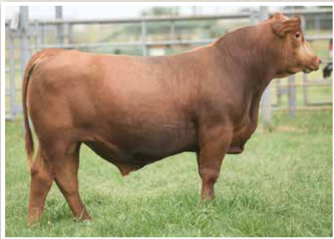
LOT 12 • Jeffries Renown 224J

H251 is another top performing bull with an 805 lb weaning weight coming from an Opportunity 53Y dam that posts top 1% EPDs for WW & YW. His sire – Messmer Packer – has been a REA carcass king for the past 15 years.