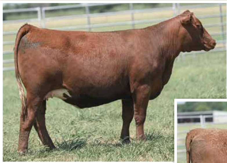
LOT 324 • Jeffries Ms Lakina J178