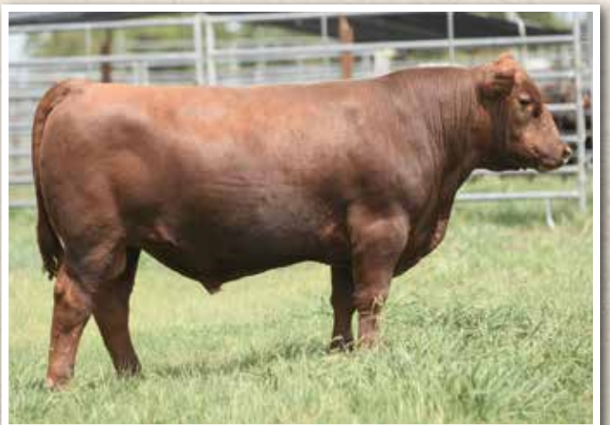
LOT 50 • Jeffries Hughes 327H

327H is a correct made calving ease bull with a 15 CED, -3.8 BW and 11 CEM. His sire H Hughes is a top 8% HB and 2% CEM bull with very high accuracies.