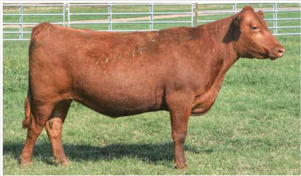
LOT 156 Jeffries Lana G253

Our Oly selection for the feature 2019 female is Lot 155, from a Brown Alliance daughter and posting a top 8% ADG. A.I. safe to EGL Guidance 9117, the Eagle Pass bull causing a major stir in the Red Angus world with a 79 lb. BW, 800 lb. WW and 1348 lb. YW! AI BRED ON 2/16/22 TO EGL GUIDANCE 9117 (RAAA:4208972). DUE: 11/25/22 PE FROM 3/5/22 TO 5/10/22 TO EGL GUIDANCE 9117 (RAAA:4208972).