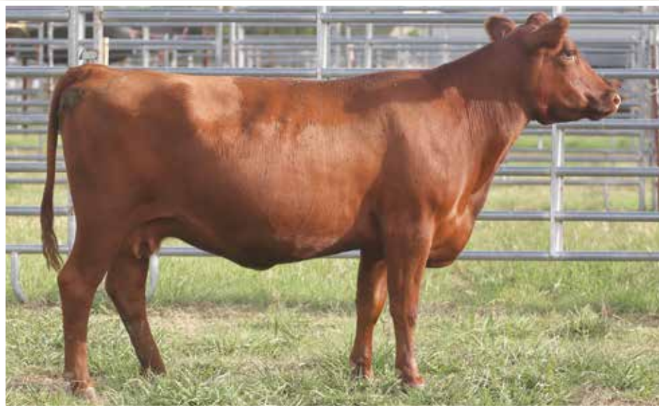
LOT 162 Jeffries Lakota G19

Lot 161 is another top performing Franchise X Rollin Deep daughter and the mother of Lot 3 bull in this Dispersal Offering. She posts an amazing 327 day Calving Interval and offers a top 6% MILK EPD. PE FROM 2/28/22 TO 5/10/22 TO SMOKY Y RENOWN 8128F (RAAA:4050574). DUE: 12/9/22