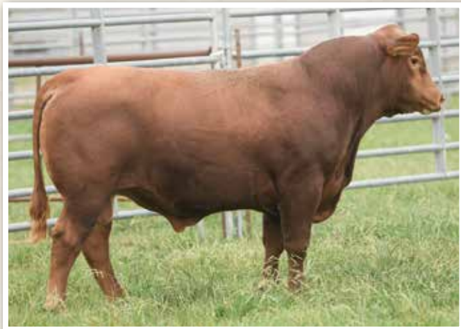
LOT 46 • Jeffries Conquest 72J

Only in a Complete Dispersal Auction do you get the chance to analyze generations of cow families and the progeny they have produced. Lot 45's dam was our top pick of the "E" model five year old cows and leads off this group as Lot 327.