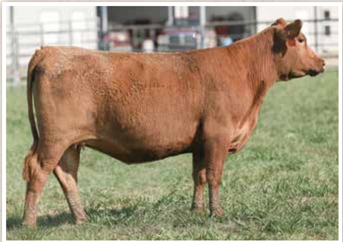
LOT 291 • Jeffries Ms Persuasion H329

This Oly X Extend female offers eight traits in the top 25% of the breed including a top 4% ADG. Her dam sells as Lot 160. AI BRED ON 1/14/22 TO EGL GUIDANCE 9117 (RAAA:4208972). DUE: 10/23/22 PE FROM 1/29/22 TO 5/10/22 TO BIEBER FOREFRONT H551 (RAAA:4308161).