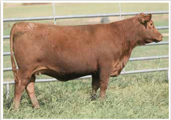
LOT 306 • Jeffries Lana J40