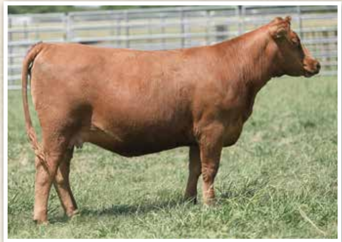
LOT 298 • Jeffries Pure Style J9

AI BRED ON 1/25/22 TO EGL GUIDANCE 9117 (RAAA:4208972). PE FROM 1/29/22 TO 5/10/22 TO JEFFRIES STOCKMAN 94J (RAAA:4466965). DUE: 12/15/22