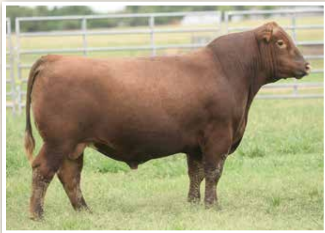
LOT 57 • Jeffries Empire 145J

Well, we are at the last 3 head bull alert but certainly not backing off of quality. This H Hughes X Jeffries Gladiator offers a very appealing 79 lb. birth weight to 648 weaning weight. His dam is one of the lead three year old "G" models selling as Lot 158.