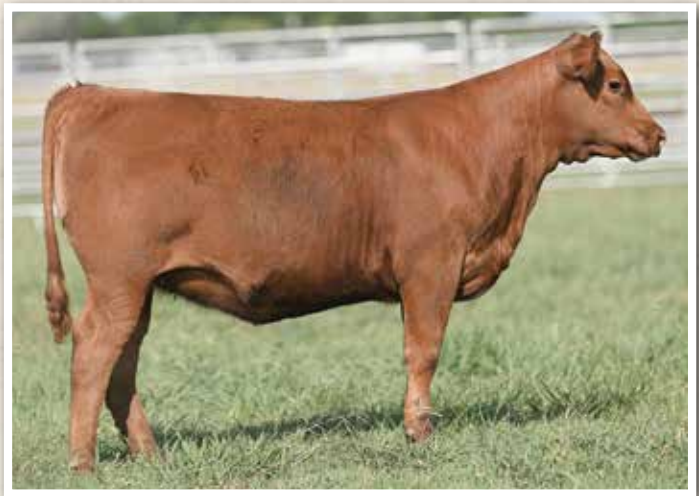
LOT 430 • Jeffries Ms Lady Rosette K60