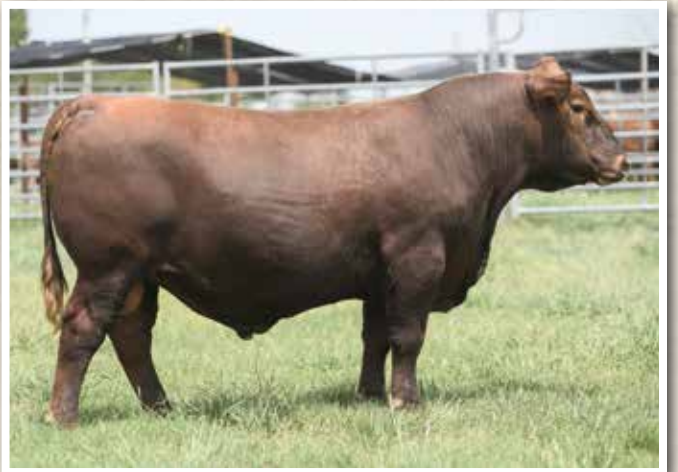
LOT 4 • Jeffries Milestone 217J

This dark red Stockman X Franchise bull will gather your interest in Checotah. He is deep made with tons of muscle and offers calving ease with a 76 lb. birth weight, a 14 CED and -1.2 BW EPD.