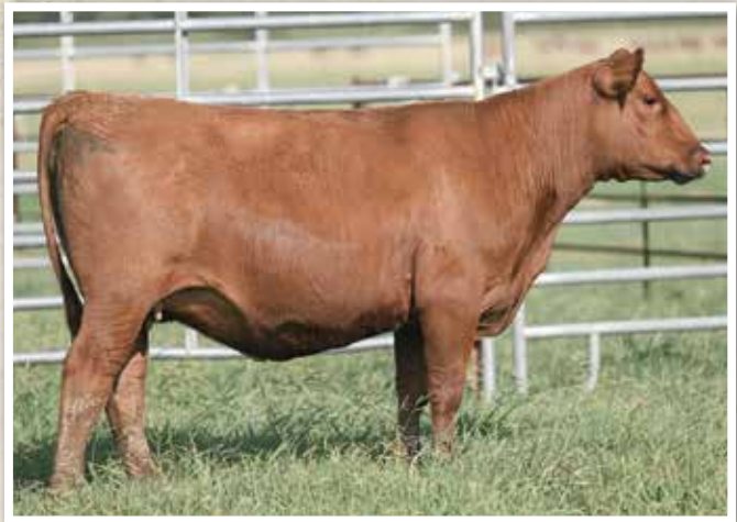
LOT 289 • Jeffries Ms Persuasion H323

This Oly X Full House daughter offers the total package -- calving ease, high growth and carcass traits. Her Bieber Forefront H551 calf will be another top prospect in your weaning pen. AI BRED ON 1/14/22 TO EGL GUIDANCE 9117 (RAAA:4208972). PE FROM 1/29/22 TO 5/10/22 TO BIEBER FOREFRONT H551 (RAAA:4308161). DUE: 1/14/23