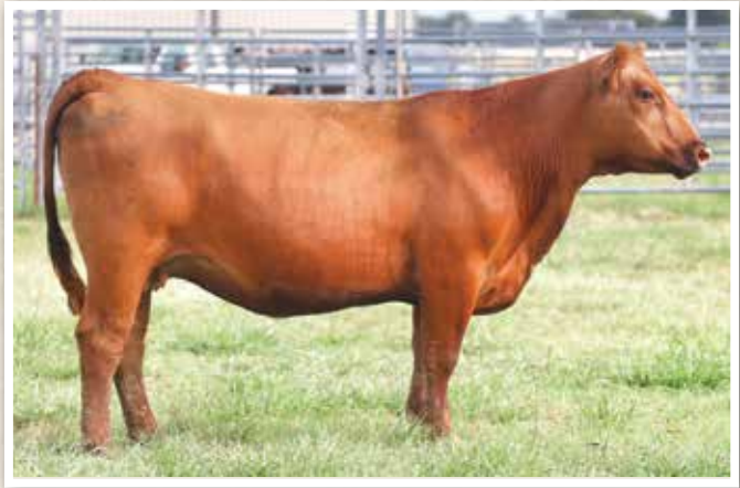
LOT 191 • Jeffries Ms Kay G223

AI BRED ON 1/27/22 TO PIE QUARTERBACK 789 (RAAA:3838837). DUE: 11/5/22 PE FROM 2/28/22 TO 5/10/22 TO SMOKY RENOWN 8128F (RAAA:4050574).