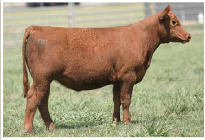
LOT 408 • Jeffries Ms Day J282