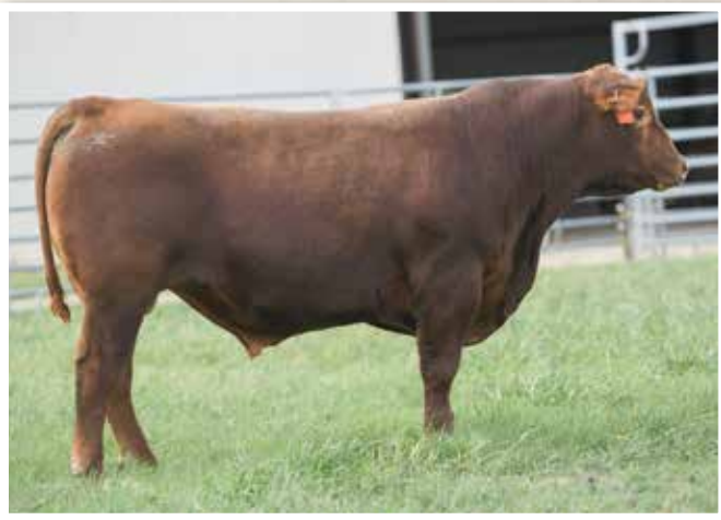
LOT 52 • Jeffries Chief Exec 118J

Another Deep Limit X Franchise bloodline bull that offers a moderate 69 lb birth weight to a 609 lb. weaning weight. His dam sells in this complete Dispersal Auction as Lot 145.