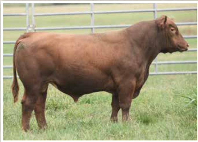
LOT 23 • Smoky Renown 42-J