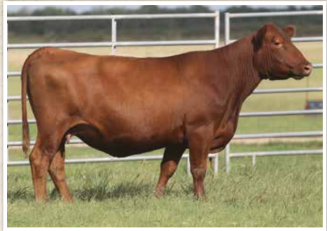
LOT 336 • Andras Belle E115

AI BRED ON 2/11/22 TO PIE MILESTONE 9713 (RAAA:4208226). DUE: 11/20/22 PE FROM 2/28/22 TO 5/10/22 TO 9 MILE BIG CHIEF 8281 (RAAA:3968872).