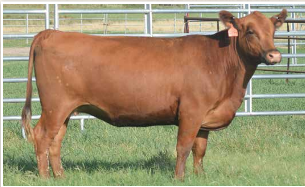
LOT 241 Jeffries Ms Kay H92

PE FROM 1/29/22 TO 5/10/22 TO PIE MILESTONE 9713 (RAAA:4208226). DUE: 12/9/22