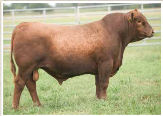
LOT 14 • MLCRA Massey's H249

Lot 14 is one of the heavy hitter EPD bulls in the offering with five EPDs in the top 7% of the breed, top 3% for ProS and top 7% HPG. His Packer dam checks in with a solid 104 MPPA. Don't miss his herd changing top 2% ProS and 6% HB.