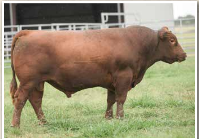
LOT 43 • Jeffries Hughes 325h

This sensational H Hughes son ranks in the top 1% of the breed for HB, 3% WW, 4% YW and 6% HPG. His Jeffries Reddington dam sells as Lot 180 with a 103 MPPA.