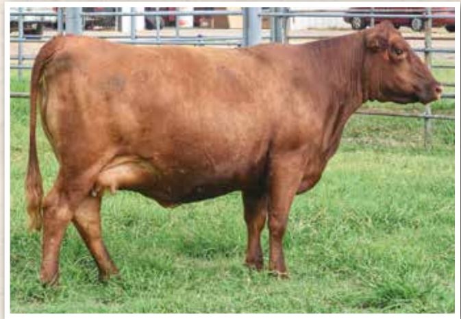
LOT 327 • Jeffries Rose E402

AI BRED ON 2/9/22 TO PIE MILESTONE 9713 (RAAA:4208226). DUE: 11/18/22 PE FROM 3/2/22 TO 5/10/22 TO PIE STOCKMAN 9173 (RAAA:4210230).