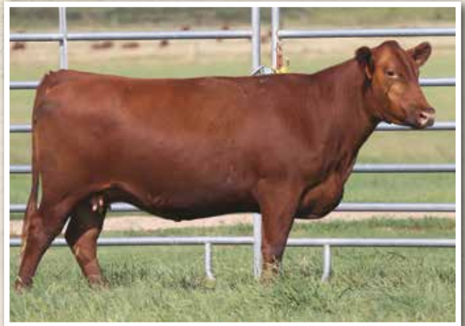
LOT 216 • Jeffries Ms Bonnie H111

Lot 216 is an excellent Franchise daughter with a 72 lb. birth weight and 617 lb. weaning weight. Her mating to PIE Milestone 9713 should put her on many checklists at the Jeffries Dispersal Auction. PE FROM 1/29/22 TO 5/10/22 TO PIE MILESTONE 9713 (RAAA:4208226). DUE: 12/9/22