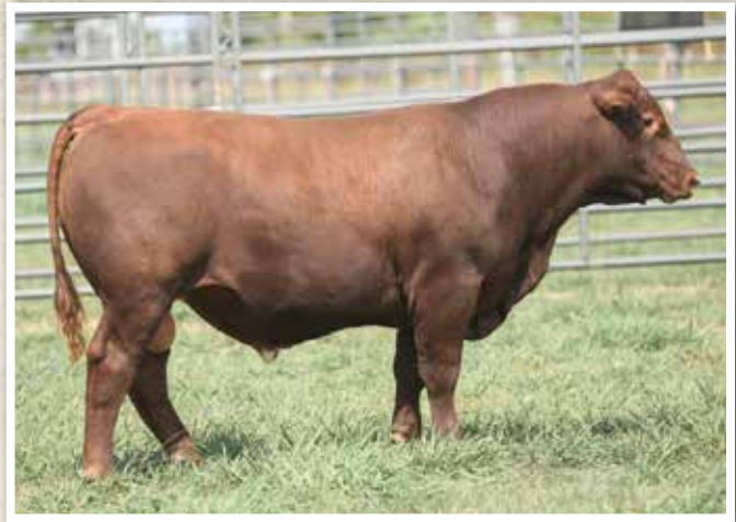
LOT 34 • Jeffries Aro 196J

The Red ARO sons will be well received in Oklahoma September 30th. 196J offers a 679 lb. WW with a 111 WR. His dam is one of the top "D" model six year old cows in this offering and sells as Lot 355.