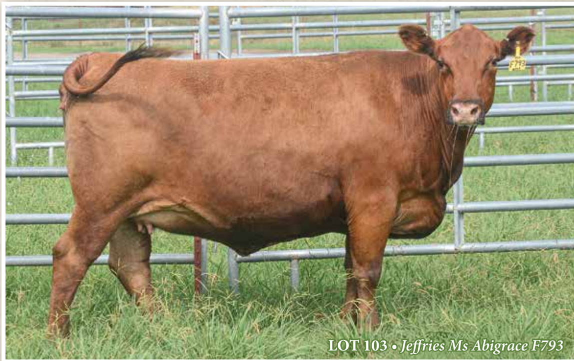
LOT 103 • Jeffries Ms Abigrace F793

This Franchise daughter offers a 106 MPPA with a AWR 110. She is a top performance queen with WW, YW, ADG, CW & REA in the top 5% of the breed and high maternal traits with MILK 2% and CEM 6%. Bred to the high growth 739 WW and 1254 YW bull -- PIE Milestone 9713! AI BRED ON 1/21/22 TO PIE MILESTONE 9713 (RAAA:4208226). DUE: 10/30/22 PE FROM 1/29/22 TO 5/10/22 TO PIE MILESTONE 9713 (RAAA:4208226).