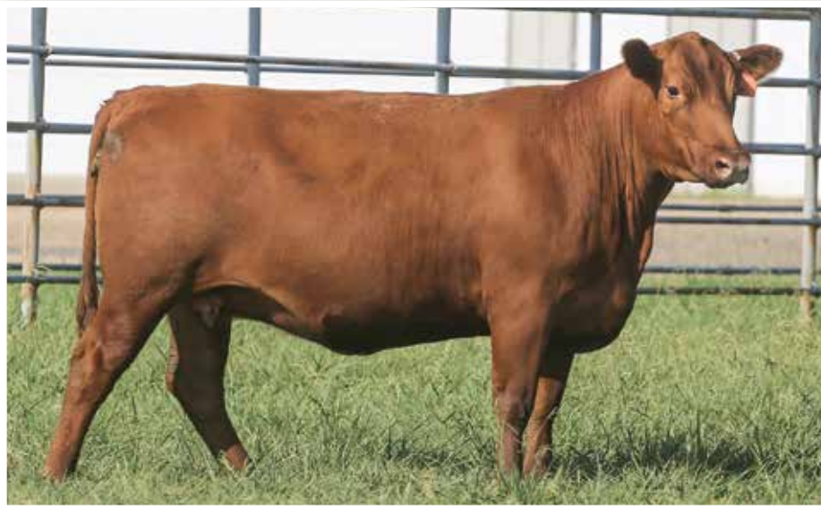
LOT 220 Jeffries Mary Beth H3

PE FROM 1/29/22 TO 5/10/22 TO BIEBER FOREFRONT H551 (RAAA:4308161). DUE: 12/15/22