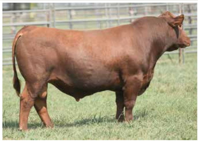
LOT 19 • Oly 83-H

This Conquest X Basin EXT son offers common sense genetics and solid performance with a BW to WW spread of 76 lb. to 693 lb. His dam adds high longevity, calving as an eleven year old in the Jeffries program.