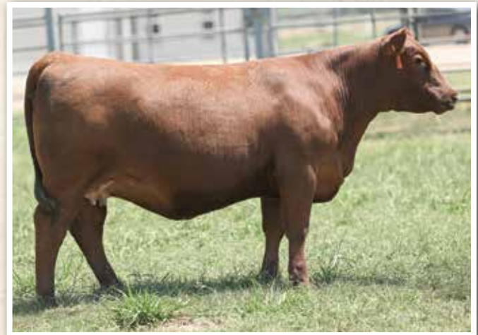
LOT 303 • Jeffries Ms Jena J21

This Pelton Wideload X Out In Front female offers a top 8% WW, 9% YW and 13% ADG & REA. Bred to the high-powered, top 3% ProS, top 1% GM bull – Bieber Forefront H551 – expect one of your top calves from this amazing bred heifer in 2022. Her dam sells as Lot 101. AI BRED ON 1/13/22 TO EGL GUIDANCE 9117 (RAAA:4208972). PE FROM 1/29/22 TO 5/10/22 TO BIEBER FOREFRONT H551 (RAAA:4308161). DUE: 12/15/22