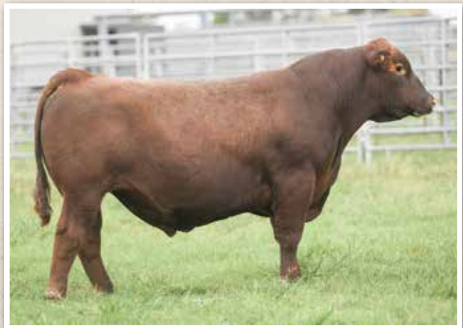
LOT 36 • Jeffries Wideload 47J

A Pelton Wideload son posting a 66 lb. birth weight and 671 lb. weaning weight. His dam is an economical and profitable female with a Calving Interval of 333 days.