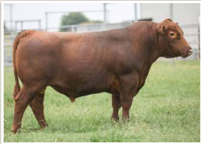
LOT 56 • Jeffries Hughes 339H