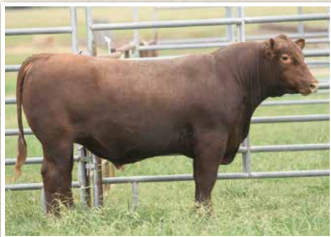
LOT 25 • Jeffries Rook 131J

This full blood Simmental bull from cooperator Massey Land & Cattle offers style and mega performance with a 732 lb. weaning weight. The popularity of F1 Simmental mated to Red Angus cows is unprecedented. Check this amazing bull out in Checotah, Oklahoma.