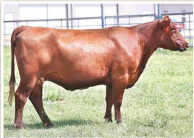
LOT 180 • Jeffries Ms Queen G147

A highly efficient cow with a 333 day Calving Interval. She is called A.I. safe to PIE Stockman 4051. AI BRED ON 2/22/22 TO PIE STOCKMAN 4051 (RAAA:1724236). DUE: 12/1/22 PE FROM 2/28/22 TO 5/10/22 TO SMOKY Y RENOWN 8128F (RAAA:4050574).