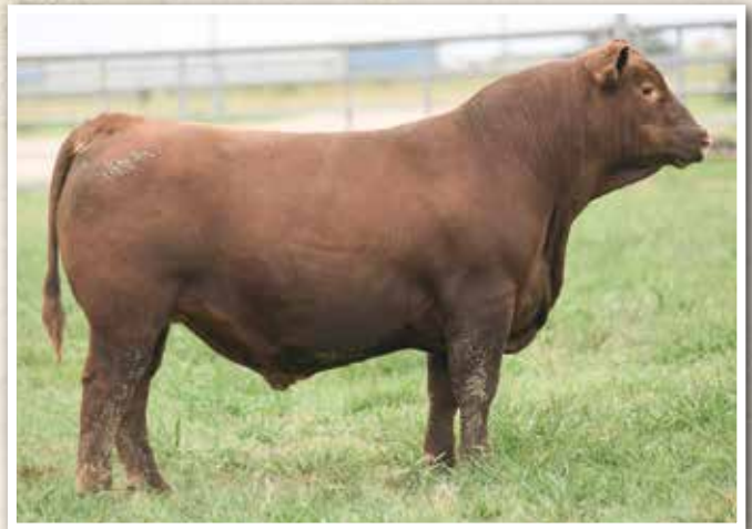
LOT 48 • JLJ 161J

If you like moderate, thick and deep cattle, 161J will be of interest in Cechotah, Oklahoma. He is certainly a calving ease prospect with a 15 CED and -4.0 BW EPD.