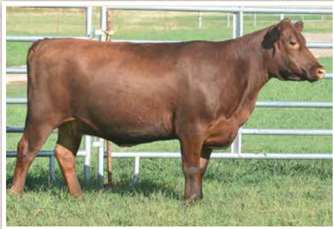
LOT 341 • Jeffries Ms Lakota E684