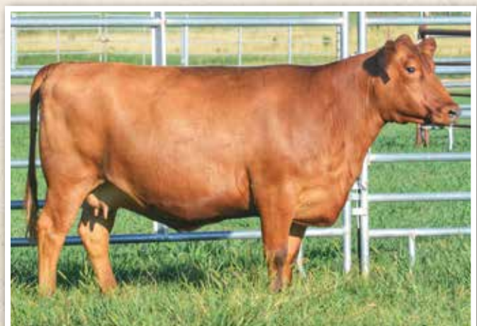
LOT 330 • Jeffries Ms Lanna E688

AI BRED ON 2/9/22 TO PIE QUARTERBACK 789 (RAAA:3838837). DUE: 11/18/22 PE FROM 2/28/22 TO 5/10/22 TO SMOKY RENOWN 8128F (RAAA:4050574).