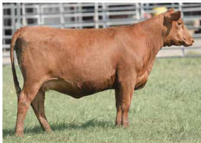
LOT 311 • Jeffries Ms Rose J74

This Wideload X Contour female offers a top 9% MARB EPD and is bred to the high powered EGL Guidance 9117. If you are on the search for Red Angus females, these bred heifers are as good as they get and will put your program on the fast-track to success. AI BRED ON 1/24/22 TO EGL GUIDANCE 9117 (RAAA:4208972). DUE: 11/2/22 PE FROM 1/29/22 TO 5/10/22 TO BIEBER FOREFRONT H551 (RAAA:4308161).