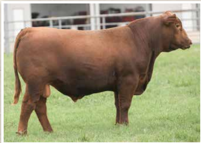
LOT 41 • Smoky Renown 21-J

Lot 40 is a top calving ease prospect with a -3.9 BW EPD and ranking in the top 5% of the breed for MARB. His dam sells as Lot 335 and records top data with a scan of 6.24 IMF to ratio 136. 106J is another top herd bull prospect from this Complete Herd Dispersal!