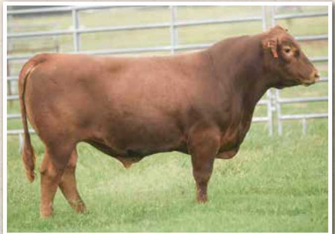
LOT 44 • Jeffries Milestone 141J

141J is a top 9% MILK EPD sire with a 69 lb. birth weight and 646 weaning weight (WR 106). His Franchise dam is one of the top 4-year-olds selling as Lot 106 and has established herself with an AWR 106 and a 102 MPPA.