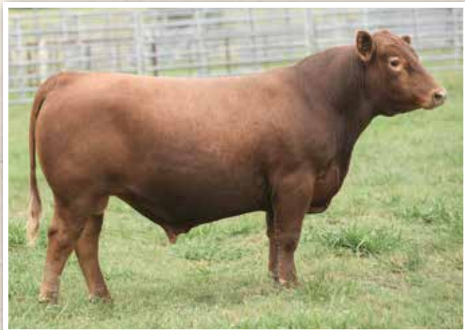
LOT 58 • Jeffries Stockman 78J

57 Lots into this sale and we are still bringing you a 68 lb. birth weight bull with a 731 lb. weaning weight. Keep in mind that with this Complete Dispersal of the Jeffries Red Angus herd that there will be no more bulls from this breed leading program.