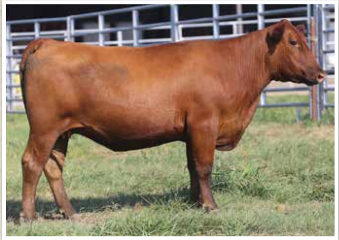
LOT 233 • Jeffries Priscilla H45

AI BRED ON 3/2/22 TO EGL GUIDANCE 9117 (RAAA:4208972). PE FROM 3/5/22 TO 5/10/22 TO EGL GUIDANCE 9117 (RAAA:4208972). DUE: 1/13/23