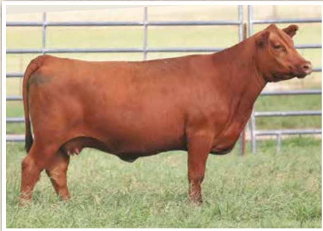
LOT 179 • Jeffries Ms Gold Cap G131