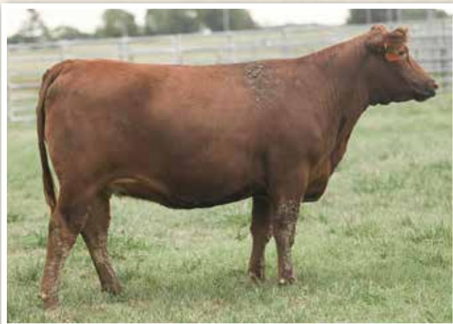
LOT 266 • Jeffries Ms Monu H200

Here is another female with proficiency in growth. She excels for weaning weight at 744 lbs. and received a 114 weaning ratio. Full House X Fritz Justice = performance. Her dam sells as Lot 398. AI BRED ON 1/18/22 TO PIE MILESTONE 9713 (RAAA:4208226). DUE: 10/27/22 PE FROM 1/29/22 TO 5/10/22 TO PIE MILESTONE 9713 (RAAA:4208226).