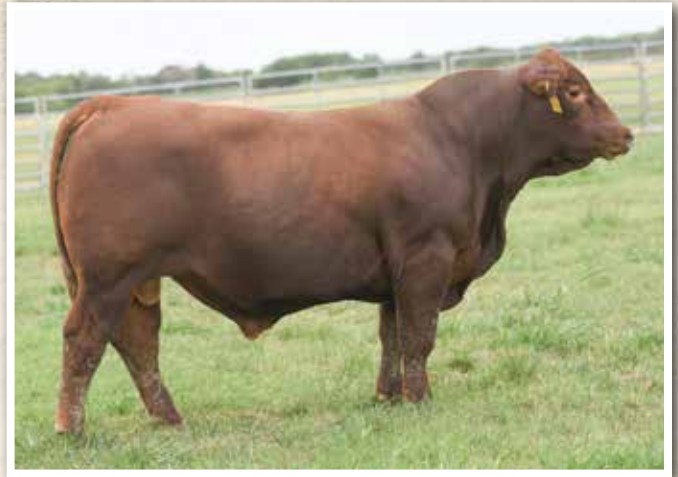
LOT 26 • Red Aro 906 J

906J is backed by a Six Mile Wild West daughter with solid carcass data including a 2.95 IMF and 12.51 REA. With a moderate 75 lb. birth weight, Lot 26 will be a top prospect if you are hunting a heifer bull from the Jeffries Dispersal. Lots of style and correctness in this one! Breeder: Cripple Creek Red Angus Ranch