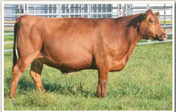
LOT 105 • Jeffries Ms Jan F802

Jeffries Ms Jan F802 offers 7 traits in the top 6% of the entire breed and showcases high growth with a top 1% MILK EPD! A Franchise X H Hughes genetic combination, this proven mating scheme has been one of the best in the program. MPPA 113, AWR 119! PE FROM 3/2/22 TO 5/10/22 TO PIE STOCKMAN 9173 (RAAA:4210230). DUE: 1/13/23