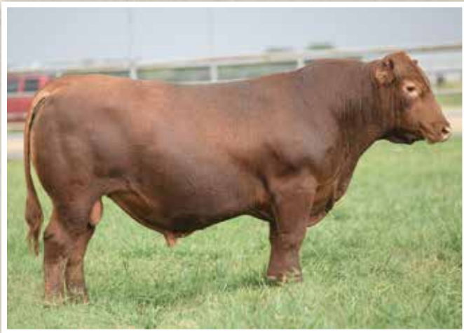
LOT 11 • MLCRA Massey's H251