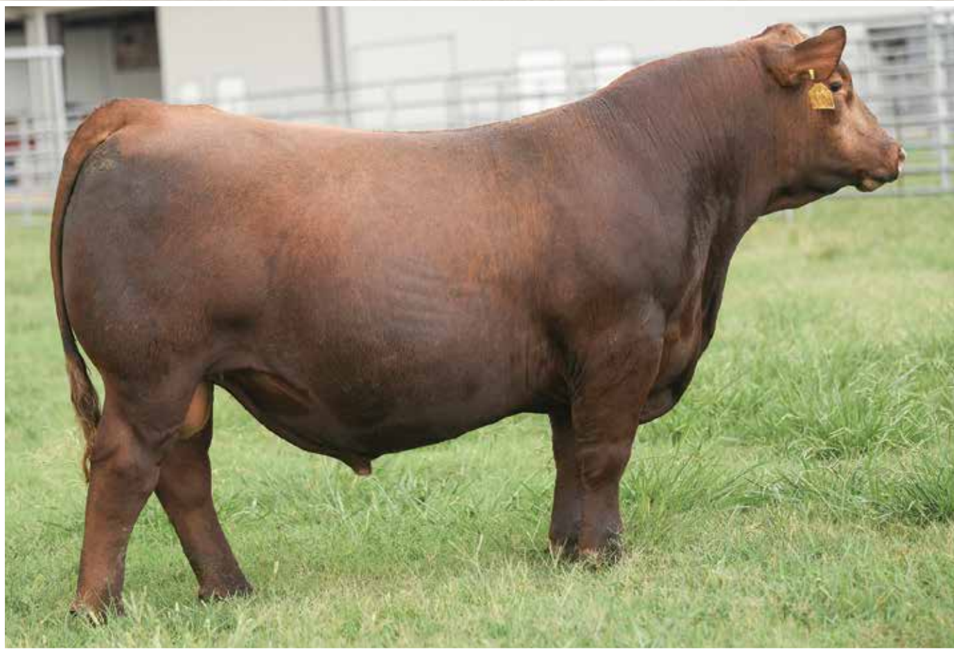
LOT 1 • Smoky Renown 65-J