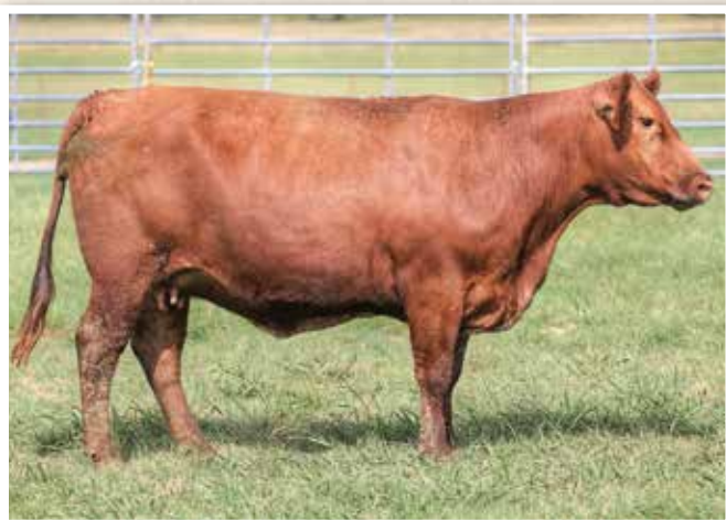
LOT 189 • Jeffries Ms Reba G202

There are several 3/4 sisters combining Gladiator with Six Mile Wild West in this offering. G178 offers a 102 MPPA, 97 ABR and 104 AWR. PE FROM 2/28/22 TO 5/10/22 TO 9 MILE BIG CHIEF 8281 (RAAA:3968872). DUE: 1/13/23