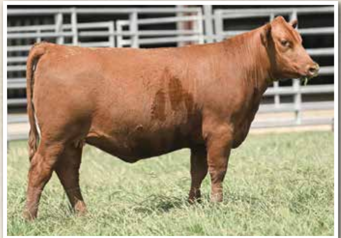
LOT 217 • Jeffries Ms Kanna H324

H324's dam is a feature cow in the 2018 "F" model section of this offering and selling as Lot 108. Lot 217 represents one of the most successful matings in the Jeffries program with sire – Bieber H Hughes X a Rollin Deep daughter. Added bonus – she is A.I. safe to EGL Guidance. AI BRED ON 1/13/22 TO EGL GUIDANCE 9117 (RAAA:4208972). DUE: 10/22/22 PE FROM 1/29/22 TO 5/10/22 TO BIEBER FOREFRONT H551 (RAAA:4308161).