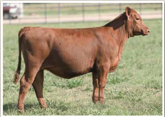
LOT 431 • Jeffries Ms Cub K61

ONLINE BIDDING AVAILABLE THROUGH DVAUCTION & SUPERIOR LIVESTOCK!