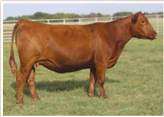
LOT 109 • Jeffries Ms Lass F88

AI BRED ON 2/21/22 TO PIE QUARTERBACK 789 (RAAA:3838837). DUE: 11/30/22 PE FROM 2/28/22 TO 5/10/22 TO SMOKY RENOWN 8128F (RAAA:4050574).